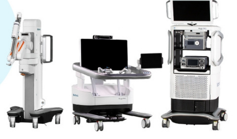
Hugo™ Robotic-assisted surgery system

Open, Lap or RAS. It's all about choice.