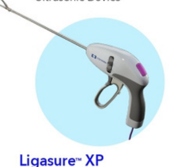
Open and Laparoscopic Sealer/Divider

Medtronic Australasia Pty Ltd 2 Alma Road Macquarie Park, NSW 2113, Australia Tel: +61 2 9857 9000 Fax: +61 2 9889 5167 Toll Free: 1800 668 670